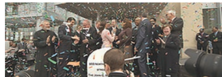
The confetti flies as invited dignitaries celebrate the opening of the first building at the Science + Technology Park at Johns Hopkins.