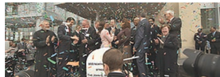
The confetti flies as invited dignitaries celebrate the opening of the first building at the Science + Technology Park at Johns Hopkins.